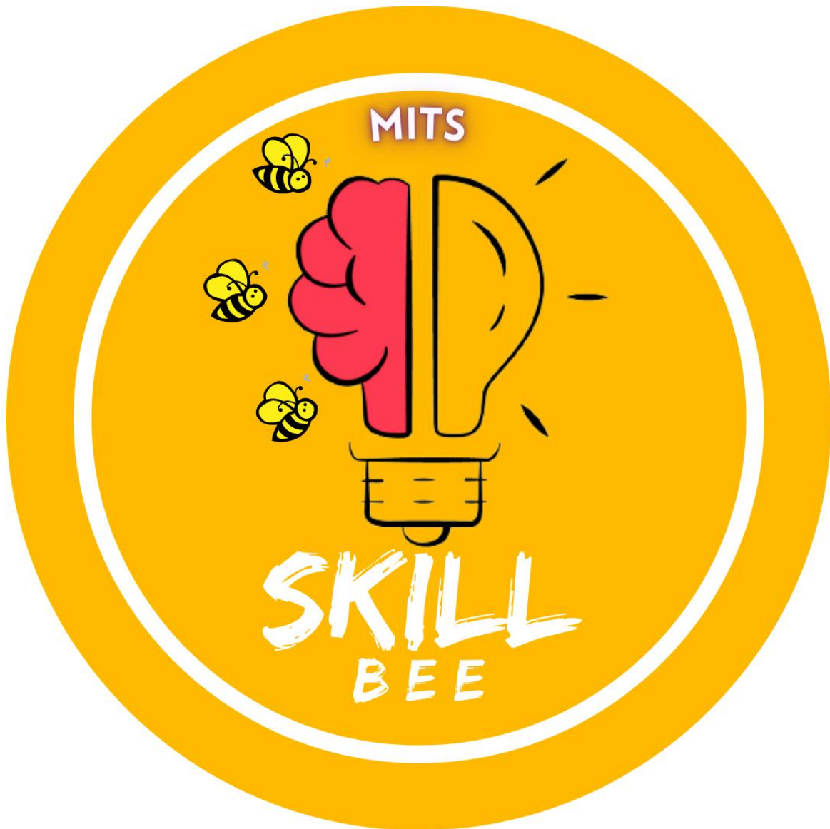
Skill Bee Club Logo

The main objective of this event is inaugurating of our Skill bee club and to motivate students about how easy it is to develop an android application, PayScale's of android app development, Freelancing opportunities and to teach about different concepts related to android app development.